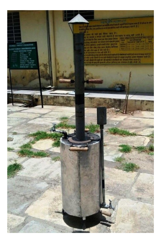
Figure 2. Developed biomass fired water heater

Thermal efficiency of the developed system was estimated using equations (1-3). To assess the thermal performance, total 80 liters of water was used to raise the temperature from 30°C to average temperature about 61°C in one hour, and one kg of babool ( Acacia nilotica ) wood was consumed. The developed biomass fired system illustrated in Figure 2. Thermal efficiency was estimated at about 54.50 %.