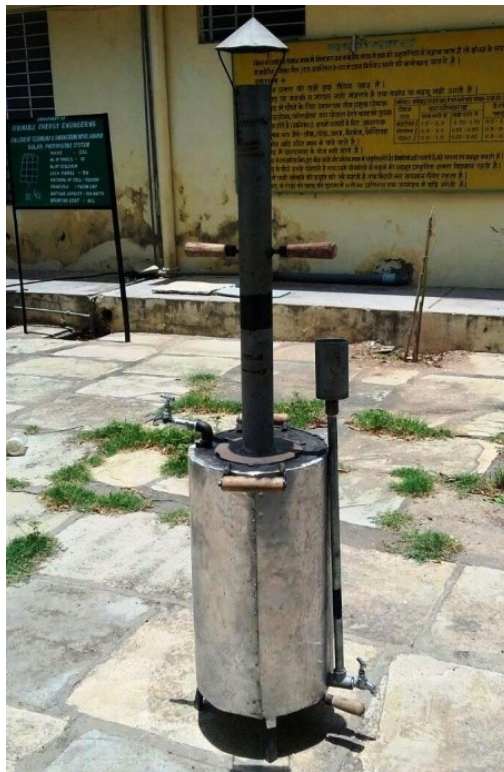
Figure 2. Developed biomass fired water heater

Thermal efficiency of the developed system was estimated using equations (1-3). To assess the thermal performance, total 80 liters of water was used to raise the temperature from 30°C to average temperature about 61°C in one hour, and one kg of babool ( Acacia nilotica ) wood was consumed. The developed biomass fired system illustrated in Figure 2. Thermal efficiency was estimated at about 54.50 %.