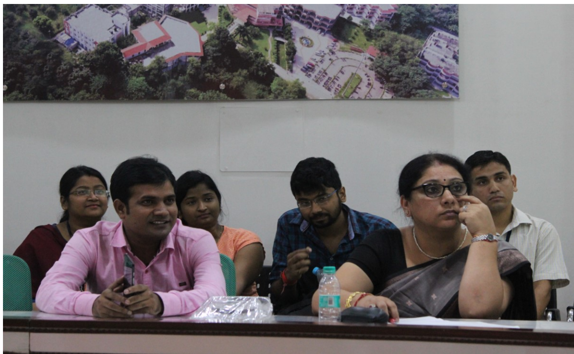
RIEECS2017-Panel of Judges During Technical Session