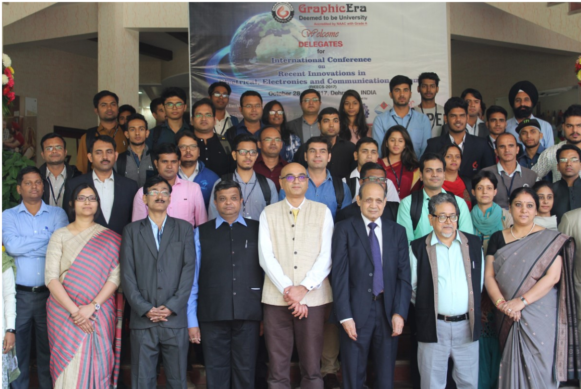
RIEECS2017-A Group Photograph