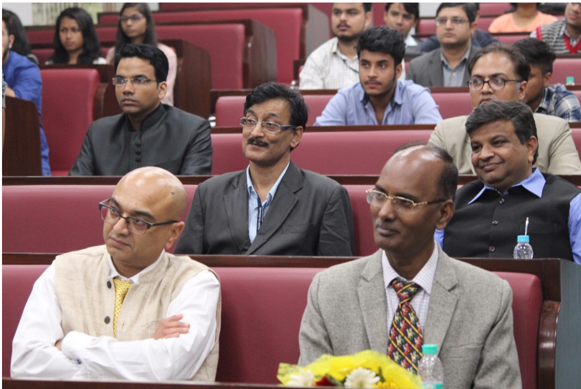
RIEECS2017- Professors (Drs.) and Students are Listening to a Speech