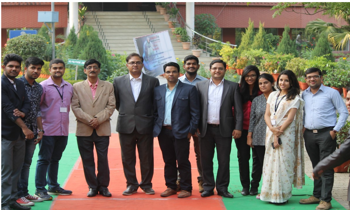
RIEECS2017-Few Organizing Committee Members