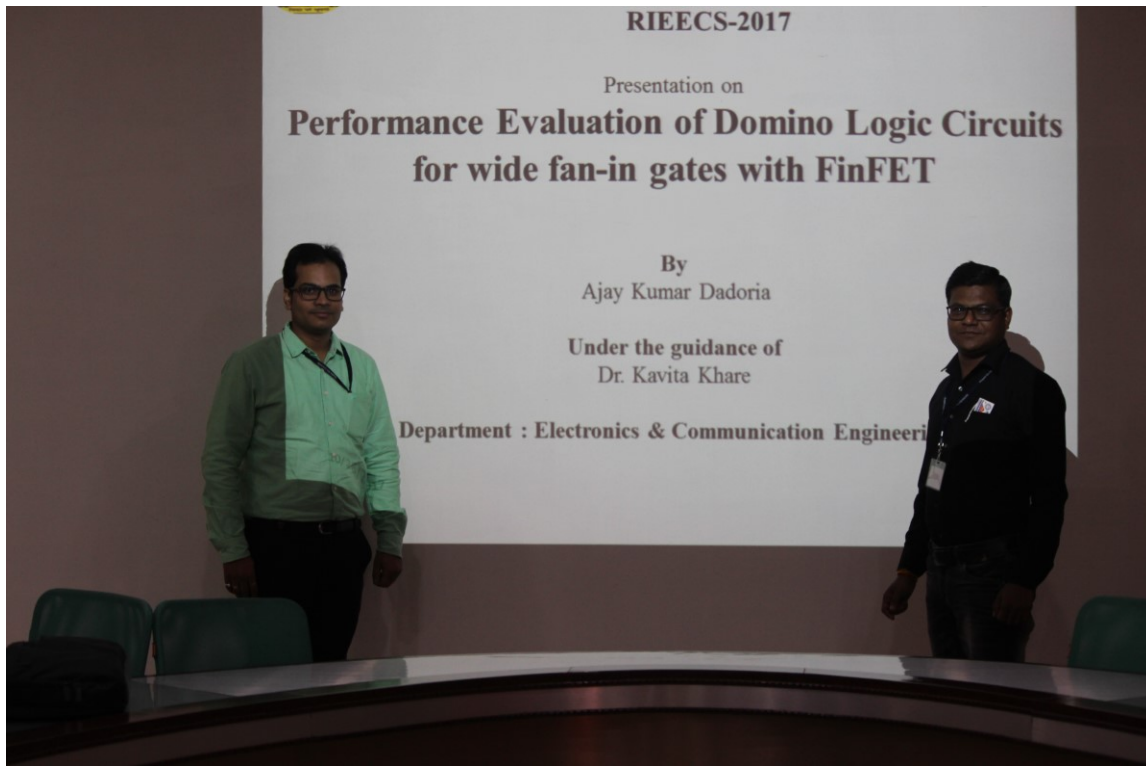
RIEECS2017-Paper Presentation by Participants